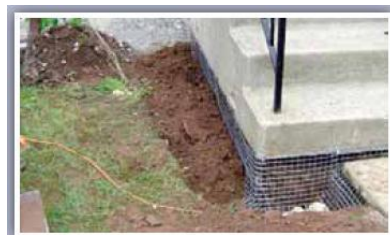
L-Shaped screen application around foundation.***