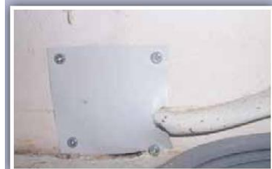
Power supply hole sealed with metal flashing.*