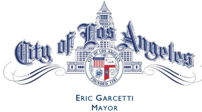
EXHIBIT "A" TO SEVENTH SUPPLEMENT TO PUBLIC ORDER