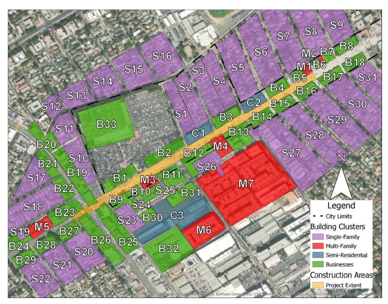
Figure 1: Overview of Sensitive Receiver Groupings in the Project Area.

The project is designed to capture and remove pollutants from stormwater and urban runoff before returning it to the water supply system. Construction activities include the installation of pumps, pipes, and a subsurface storage tank designed to hold approximately 132,000 cubic feet of water. In addition, the driveway entrances to the Costco (receiver B33) parking lot will be replaced and medians will be added to the street along Washington Boulevard. Equipment used during these construction activities produce noise and vibration which have the potential to negatively impact the surrounding community. This report presents the results of an assessment which predicts the noise and vibration levels at nearby homes and businesses during the various construction stages. These estimated noise and vibration levels are then compared against limits set by the City of Culver City Municipal Code (CCMC), the City of Los Angeles Municipal Code (LAMC), and the Caltrans Construction Vibration Guidance Manual* In cases where the predicted levels exceed the limits set by the code, mitigation measures are recommended.