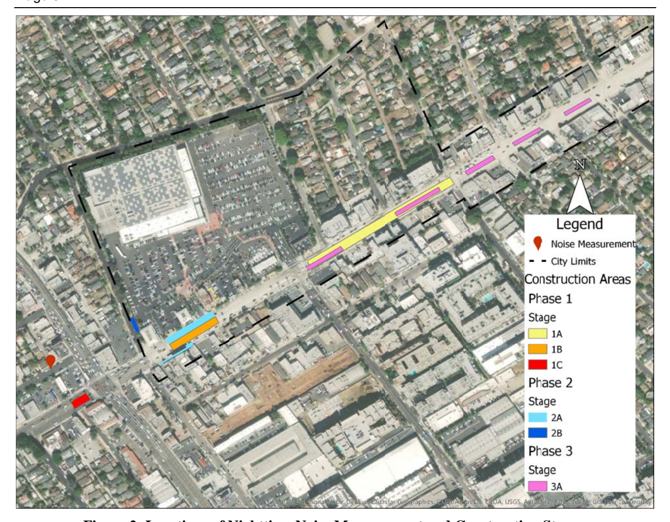
Figure 2: Locations of Nighttime Noise Measurement and Construction Stages.

Operation 6: Nighttime work in the City of Los Angeles, including excavation, sheet pile driving, and trenchless installation of the line "F" sewer connection pipe. Modeling assumed the boring machine and other equipment will be operating in the Phase 1B work area.