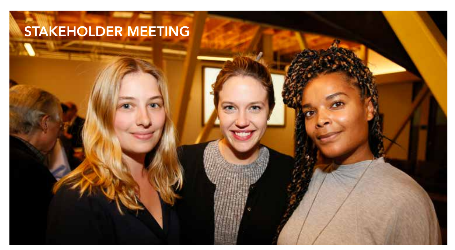
2017 Creative Economy event at Framestore

Members from Culver City's creative industries were invited to a stakeholder meeting on July 11, 2019, at the Wende Museum. The purpose of the meeting was to solicit feedback on the findings of the Creative Economy Report. Participants were invited to meet and identify the needs of Culver City's creative industries and make recommendations about ways to support creative and cultural organizations' continued contributions to Culver City's economic growth.