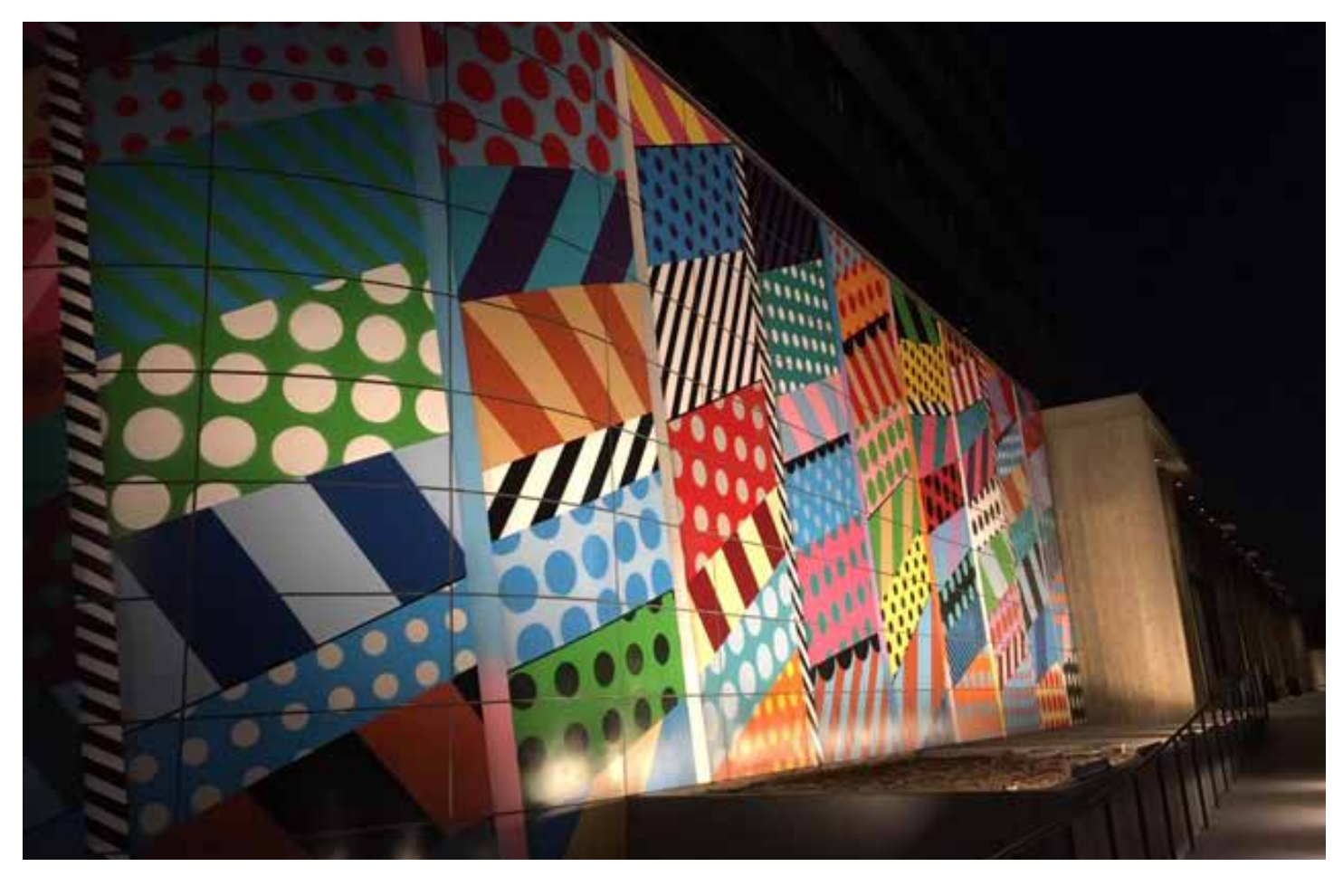
Bloom Dimension by Jason Woodside