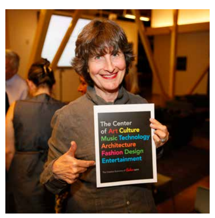
2017 Creative Economy event at Framestore

The World Café was a method that facilitated discussions about what mattered and allowed all voices to be included in the process. While not all members of Culver City's creative organizations were involved in the stakeholder meeting, the meeting should be considered an important point of departure for future discussions during the preparation of the Community Cultural and General Plan updates.