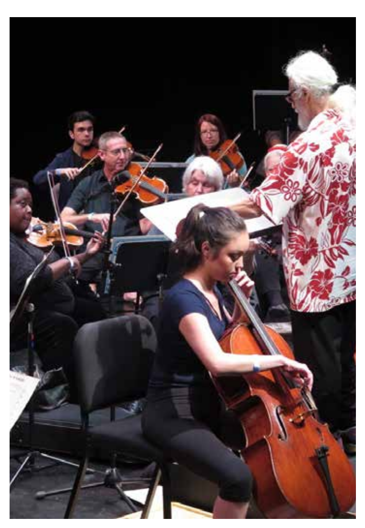
Culver City Symphony Orchestra