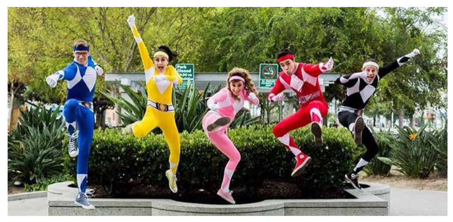
The Actors' Gang

In addition to these three geographic areas, creative for-profit and nonprofit organizations are located throughout the city. For instance, performing arts groups such as dance, theatre, music, symphony orchestras, choral music groups, as well as arts education and programs that engage community members in learning about or participating in arts-related events serve as cultural influencers and contribute to the creative economy. The growing influx of creative organizations into Culver City has contributed to a rapid shift in the traditional geographic areas for the creative economy.