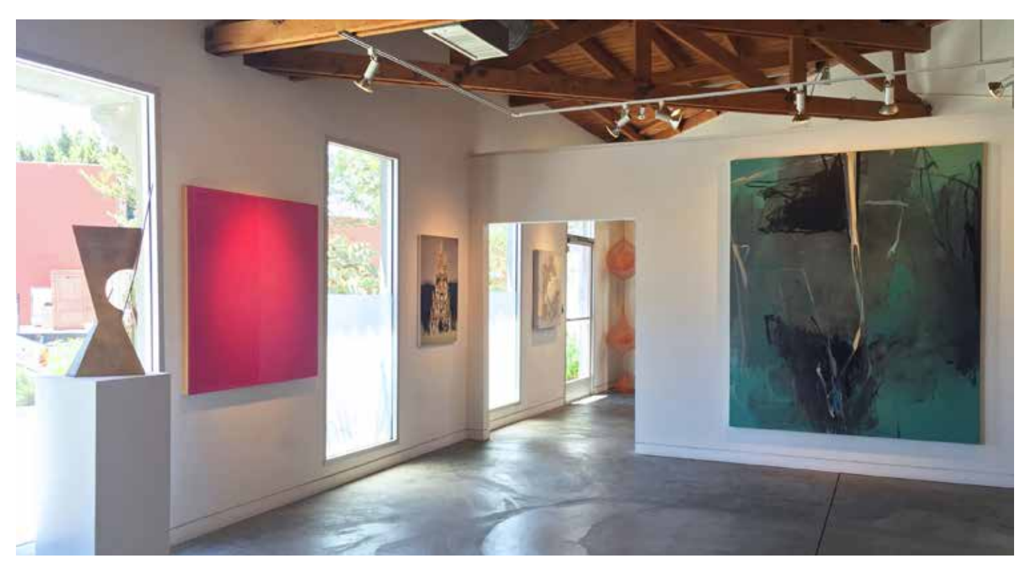
Fresh Paint

Other issues affecting the creative economy, particularly with respect to public art was the participants' observation that public art is not well cared for. This lack of maintenance (the streetscape and pedestrian walkways) sends a message that public art is not important. To change this perception, the participants suggested that Culver City support the creative community by developing a plan to create an environment for people to appreciate public art (clean streets, adequate lighting, gardening and maintenance). Another suggestion was to engage developers in supporting the community including providing low-income housing for artists who are displaced by high rents. Finally, the participants suggested that Culver City encourage developers to create and fund arts budgets as a means of investing in the city's creative economy.