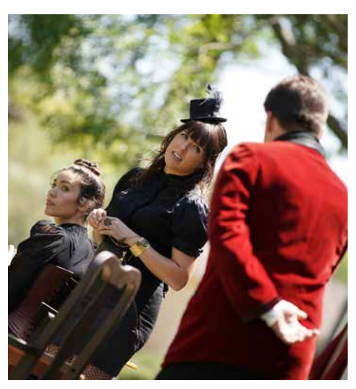
Culver City Public Theatre / Photo: Caleb Kneuven

Creative industries in Culver City include fashion, digital media, entertainment, product and industrial design, publishing and printing, fine and performing arts schools, performing arts providers, communication arts, toys, architecture and interior design, and art dealers. According to the Creative Economy Report, these industries employed over 8,000 individuals and generated over one billion in income by 2014. Communication arts, digital media and entertainment accounted for the most employment opportunities in Culver City. The Report also noted that in addition to documented salaries and wages, growth in the city's creative economy was also fueled by self-employed individuals (although specific data were not as readily available).