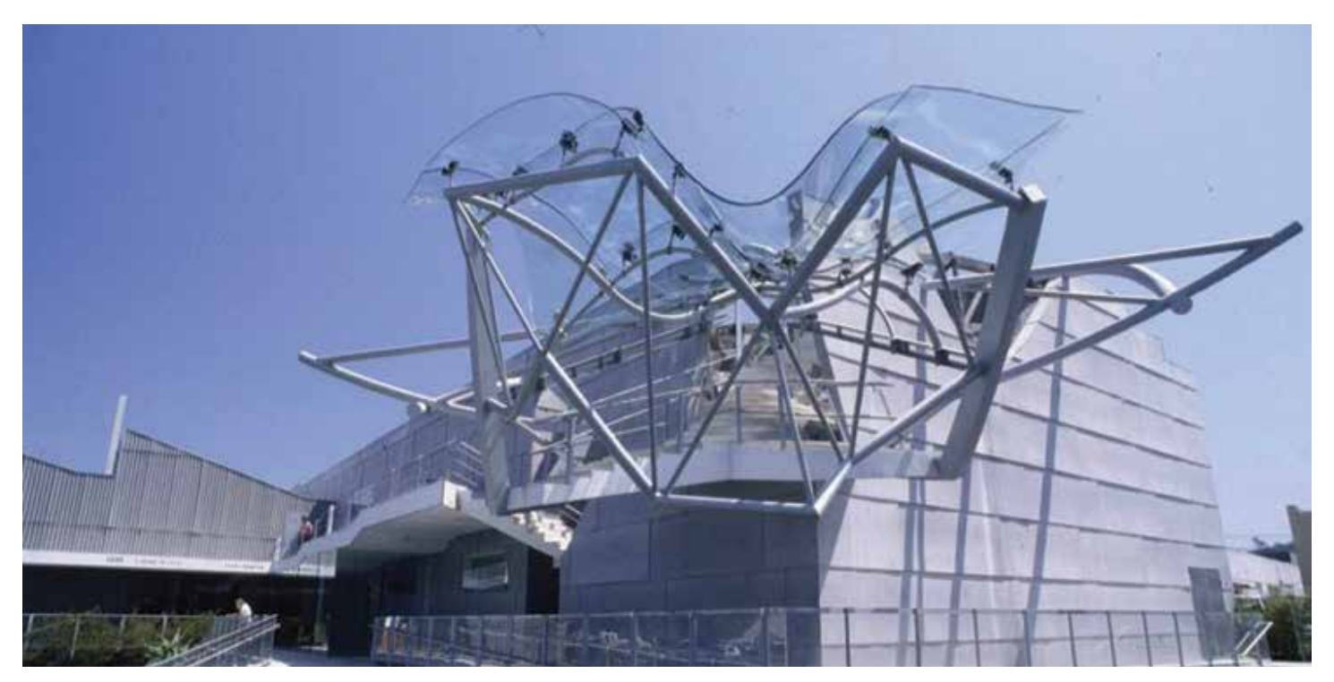
Umbrella by Eric Owen Moss

Meeting participants were also grouped according to industries. They responded to the third question that focused on specific industry needs to sustain their contributions to Culver City's economy. For the final question, the table groups included Architecture and Design, Performing Arts Schools, Performing Arts Providers, Entertainment and Arts, and Education. Each table group was asked to consider resources and supports necessary to enhance their contribution to Culver City's creative economy.