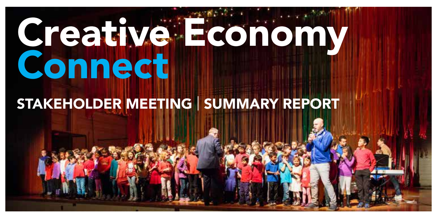
Front & Center Theatre Collaborative Extravaganza