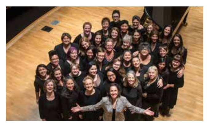
Vox Femina Los Angeles

This report captures the recommendations and ideas from the meeting participants in detail. All are consistent with recommendations from the Culver City Economic Development Implementation Plan, and the Culver City Strategic Plan. Most notably were recommendations for assisting creative organizations with commercial space or venues, facilitating partnerships between corporations and creative organizations, providing opportunities for workforce development, internships and apprenticeships, and financial investments in arts, creative projects and organizations. The stakeholder feedback and recommendations contained in this report will hopefully help to inform planning for Culver City's Economic Development, Community Cultural and General Plan updates.