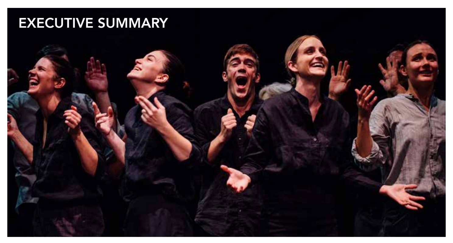
The Actors' Gang

The landmark 2017 CREATIVE ECONOMY REPORT OF CULVER CITY recognized the significant contributions of creative industries to our city's economic vitality, competitiveness and recent growth at a rate faster than nearly every other local economy in Los Angeles County, including the City of Los Angeles. Even more encouraging, our Creative Economy has produced a multiplier effect in which our existing base is attracting new creative businesses at an exceptional rate, thereby growing our local workforce and the amount of revenue they generate.