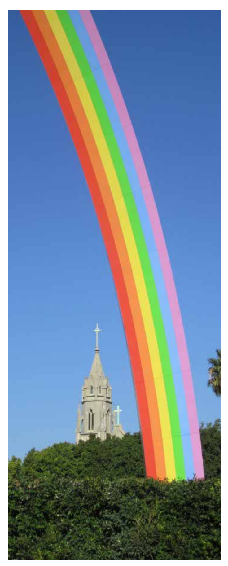
Rainbow by Tony Tasset