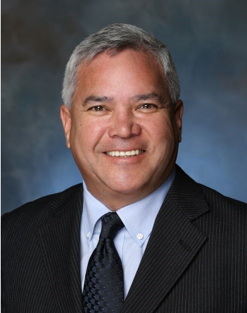
Mayor Thomas Aujero Small