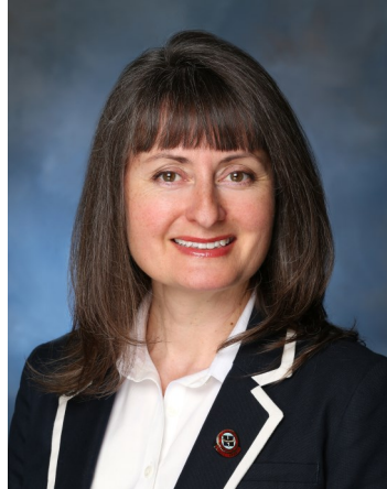
Vice Mayor Meghan Sahli-Wells