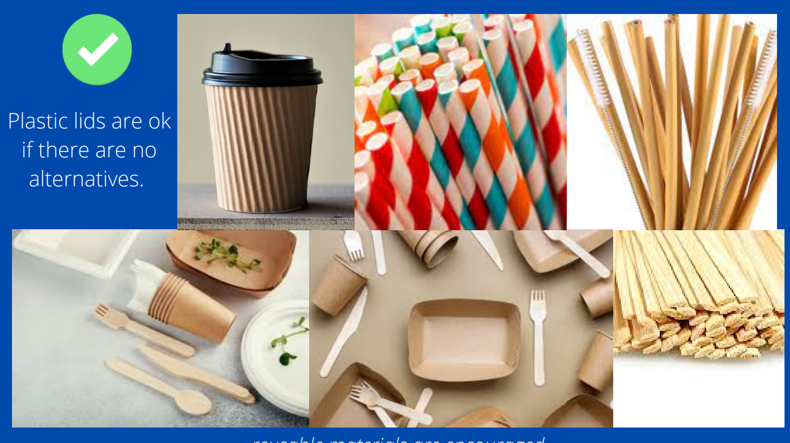
reusable materials are encouraged