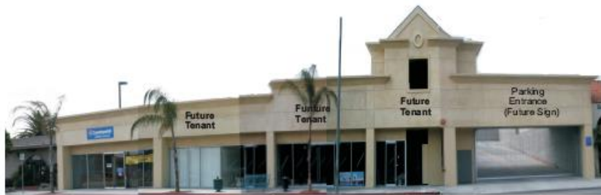
MASTER SIGN PROGRAM