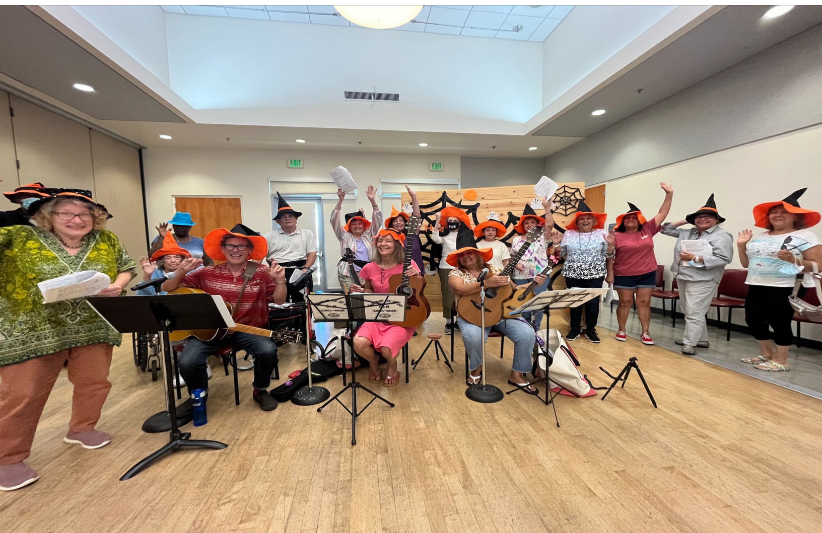
CCSCA Glee Three Sing-Along Group